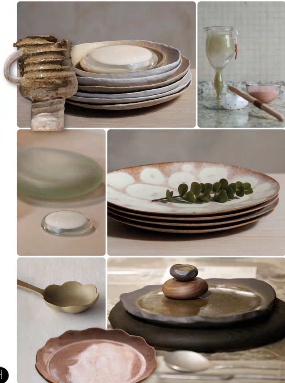
earthy dining rituals