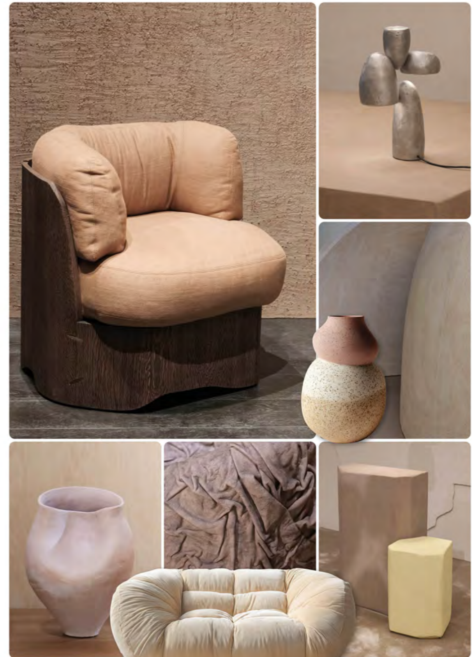
warm rounded softness