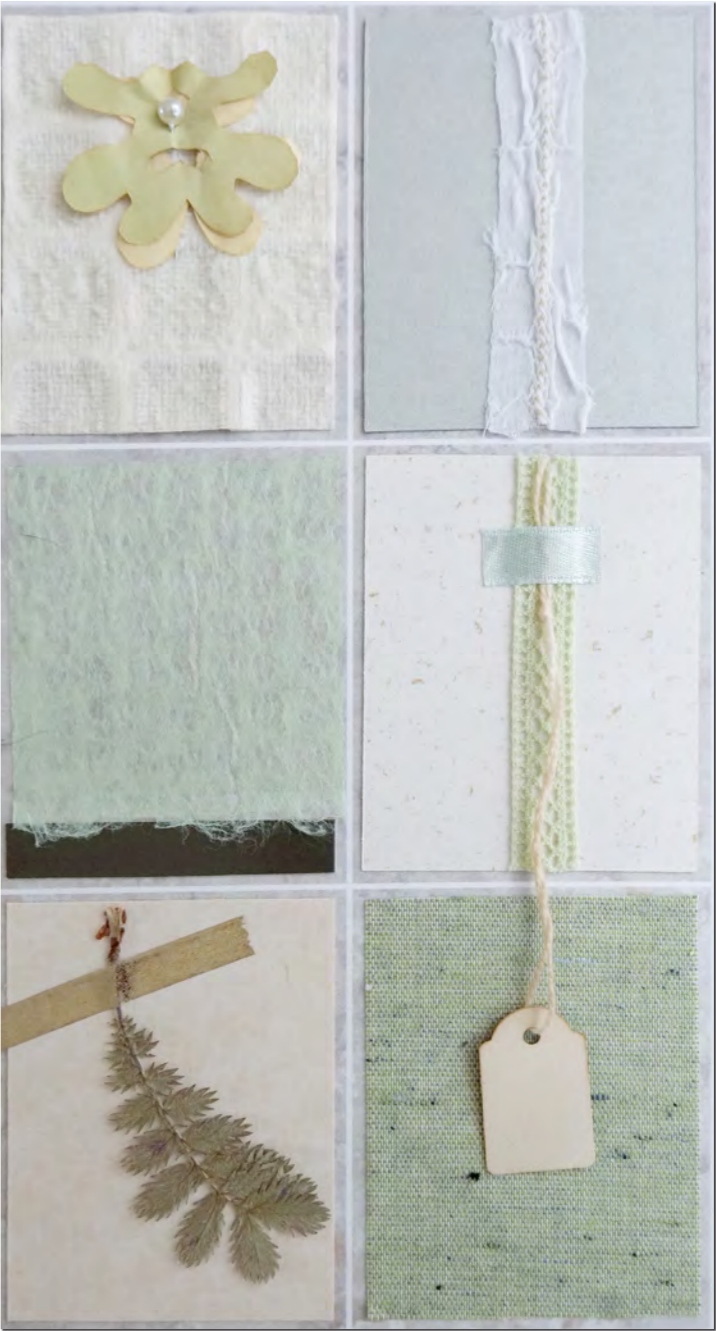
Real materials that have been carefully adhered.