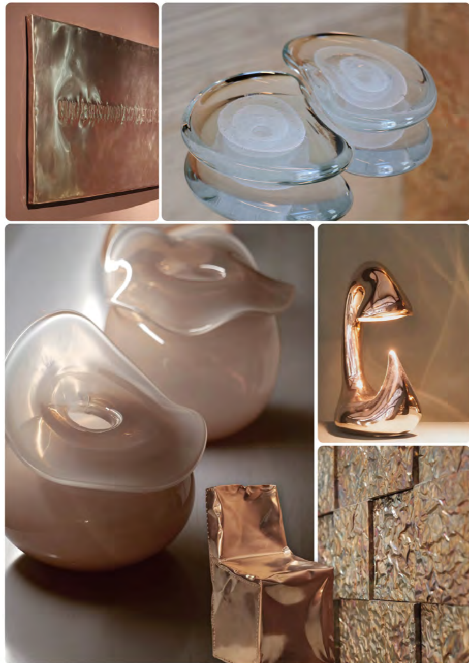
molten lustrous forms